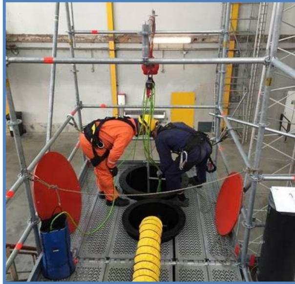
Rope Rescue Operations

Practical sessions will be organized for delegates to practice the theory learnt. Delegates will be provided with an opportunity to carryout rope rescue operations using Haward equipment. Theory learned in the class will be applied using the rope rescue methods and equipment.