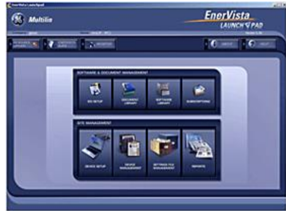
GE Multilin Relay 469 Simulator