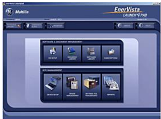
GE Multilin Relay 750 Simulator