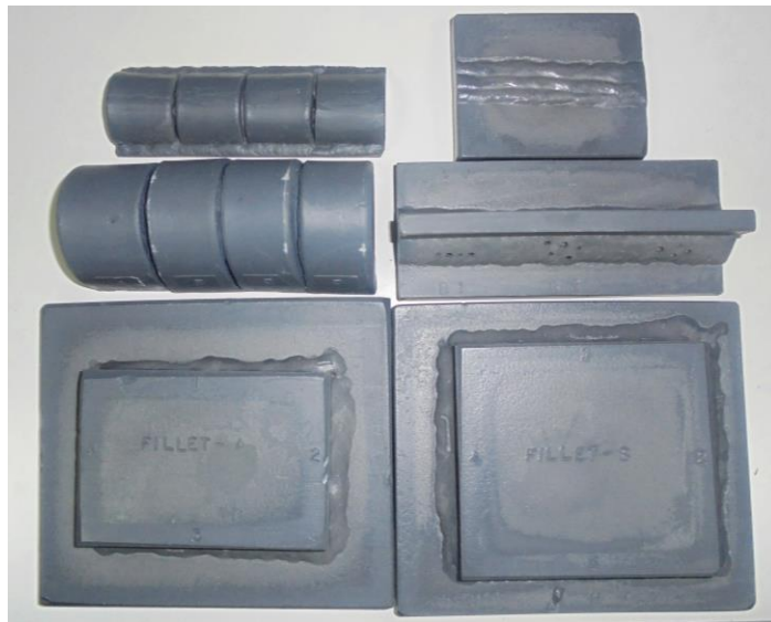
American Welding Society (AWS) Tool Kit and Structural Weld Replica Kit