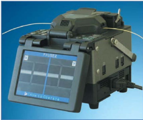
FSM-50S PROFILE ALIGNMENT FUSION SPLICER

Practical sessions will be organized during the course for delegates to practice the theory learnt. Delegates will be provided with an opportunity to carryout fiber optic splicing, testing and troubleshooting exercises using the following state-of-the-art fiber optics technology and equipment, suitable for classroom training.